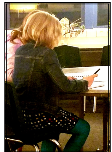
Level III: Journaling and further pondering after a presentation